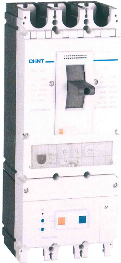
Images of NM8NL series

Signed for and on behalf of Zhejiang CHINT Electrics Co., Ltd. — Chint Industrial Zone, March 26, 2020